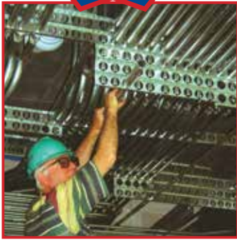
Stack Overhead in Tight Areas