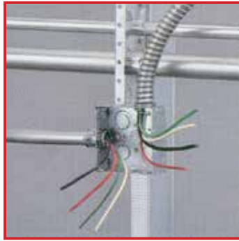
Vertical on Walls