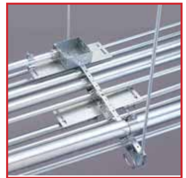
Attach Conduit/Box Support Plates Above & Below Conduit