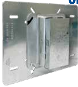
BSB1-FTD (See page IP28)

PLUS...Compete Aggressively and Win Larger Jobs with More Profit