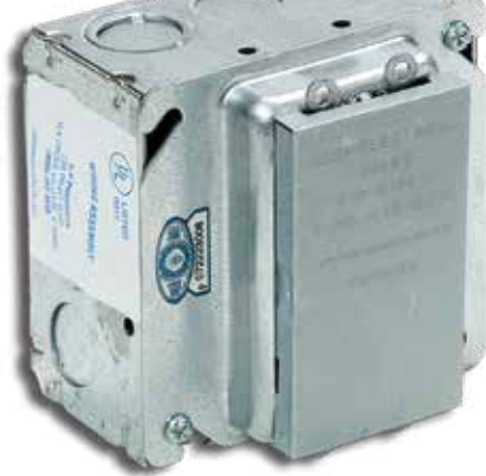
2-Gang = SOC-2G PATENTED