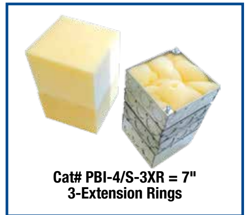
Cat# PBI-4/S-3XR = 7" 3-Extension Rings