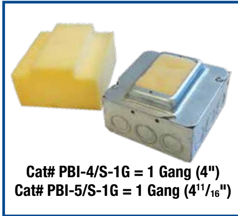
Cat# PBI-4/S-1G = 1 Gang (4") Cat# PBI-5/S-1G = 1 Gang (4 11/16 " )