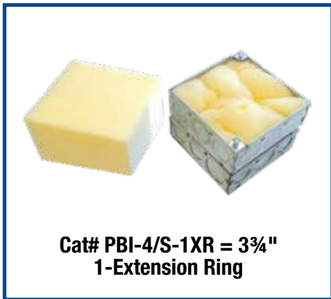
Cat# PBI-4/S-1XR = 3 3/4 " 1-Extension Ring