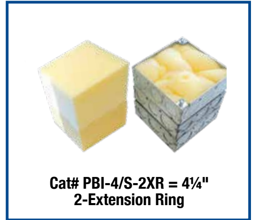
Cat# PBI-4/S-2XR = 4 1/4 " 2-Extension Ring