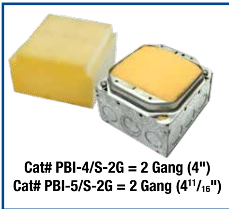
Cat# PBI-4/S-2G = 2 Gang (4") Cat# PBI-5/S-2G = 2 Gang (4 11/16 " )