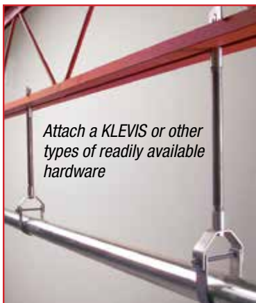
Attach a KLEVIS or other types of readily available hardware

Distributes load evenly over center of bar joist. Eliminates angle iron distribution.