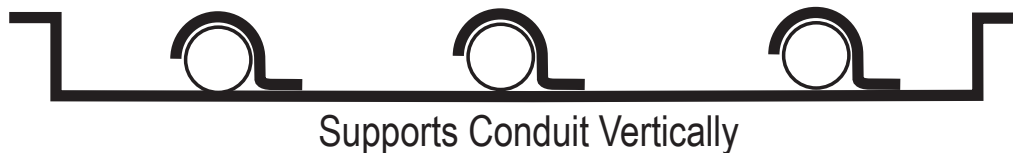
Supports Conduit Vertically

Cat# CWVR-16-178 = 16" Stud Spacing - 1 1/8" Depth Cat# CWVR-24-178 = 24" Stud Spacing - 1 7/8" Depth