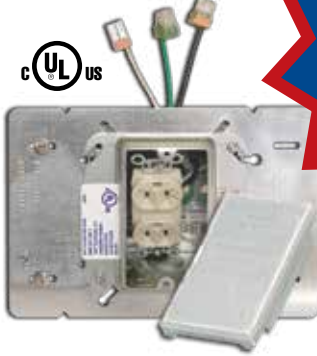
20 Amp - CS20AC1 Cat# MC PF 4-S

SP's 16 gauge 1 gang bracket no back bracket needed BSB-1FTD (See page IP28)