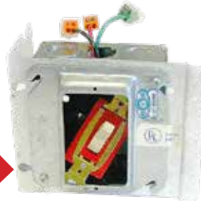
20 Amp - CRB5362 Cat# MC PF 1-R