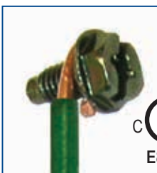
Green Ground Set Screw