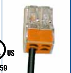
Push On Type UL Listed for 600 volt - 20 amp