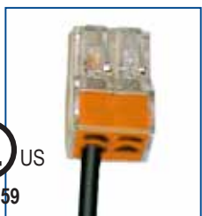
Push On Type UL Listed for 600 volt - 20 amp