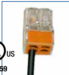
Push On Type UL Listed for 600 volt - 20 amp