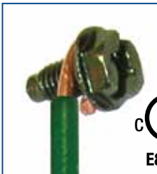
Green Ground Set Screw