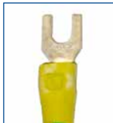
Spade or Fork Terminal