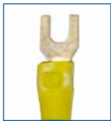
Spade or Fork Terminal