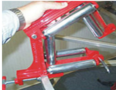
Cat# CTR-12S 12 inch "Split Box" tray roller. Unit quickly clamps to tray.