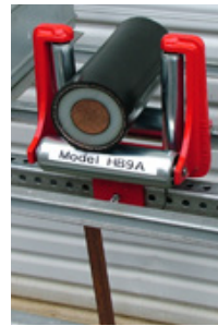
Cat# CTR-9U "U" Shaped Roller Unit.

Suitable for 4" thru 7.5" cable tray sidewall (please specify sidewall dimensions prior to ordering)