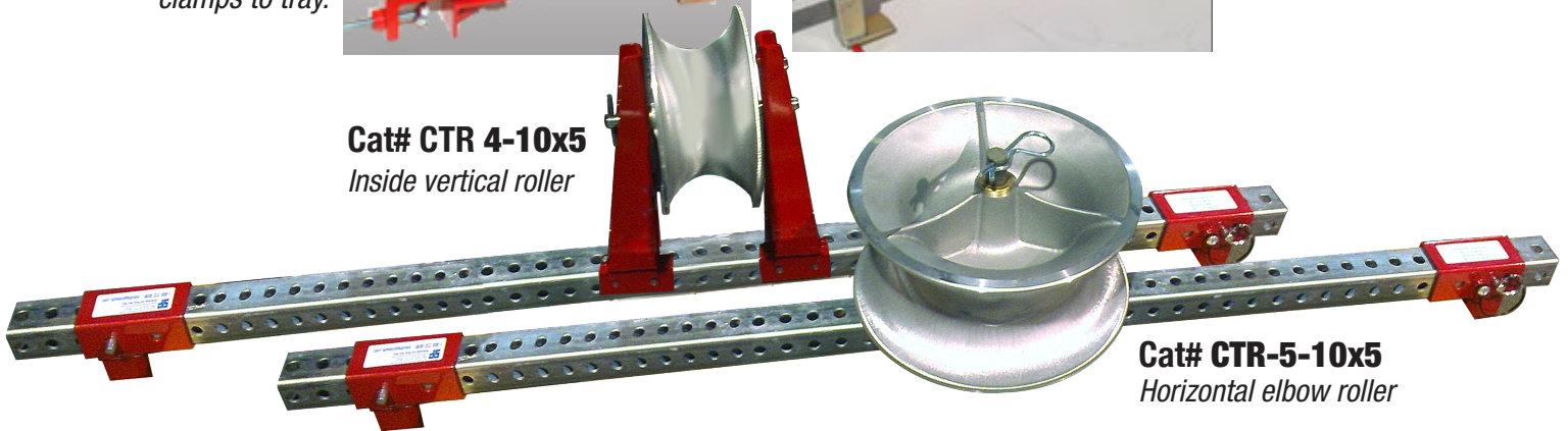
Cat# CTR-5-10x5 Horizontal elbow roller