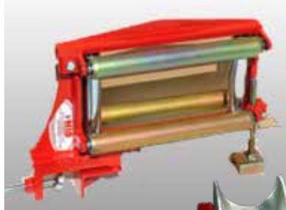
Cat# CTR-6S 6 inch "Split Box" tray roller. Unit quickly clamps to tray.