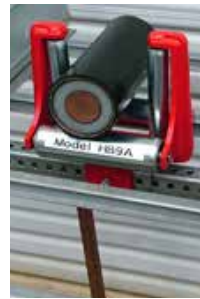
Cat# CTR-9U "U" Shaped Roller Unit.

Suitable for 4" thru 7.5" cable tray sidewall (please specify sidewall dimensions prior to ordering)