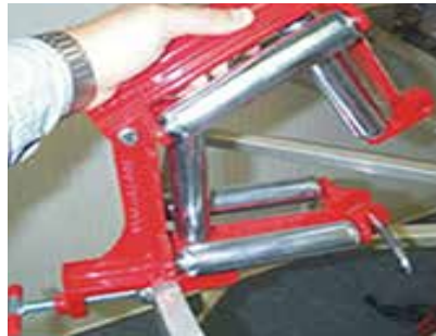
Cat# CTR-12S 12 inch "Split Box" tray roller. Unit quickly clamps to tray.