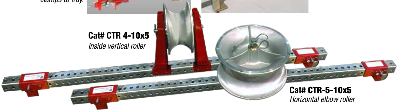
Cat# CTR-5-10x5 Horizontal elbow roller