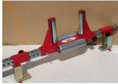
Cat# CTR-6-10x5 Outside vertical riser/roller